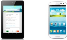
Tablet or Smartphone

Adding a LMS Data USB OTG cable gives massive expansion of a customers current and new USB peripherals - all without the need for any device drivers, thats the beauty of USB OTG..