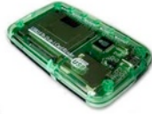
USB Card Readers